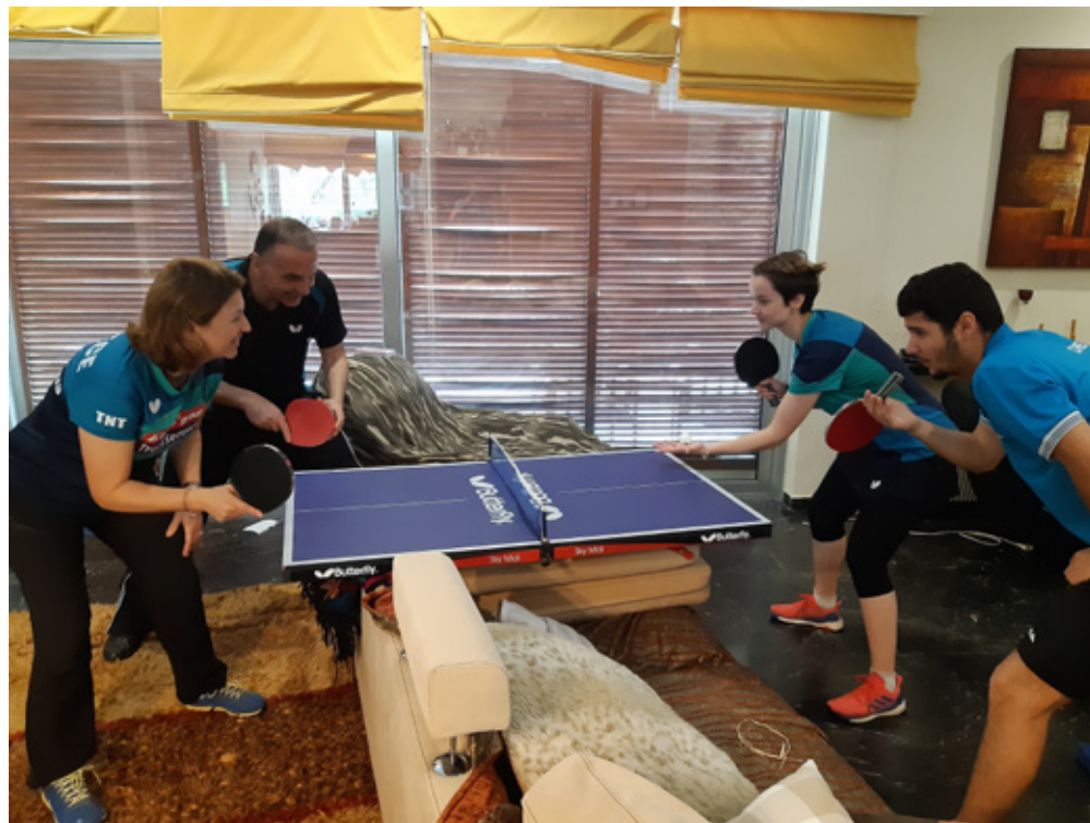
Table tennis lovers from all over the globe celebrated this year's World Table Tennis Day edition from home in order to stay safe, mindful, active and healthy. The event is consistently growing – especially geographically. Have a look where and how people celebrated in their home sometimes using the most funniest objects to hit the table tennis ball, to play on a different kind of table or to build a net.

to everyone who joined our world table tennis 'at home' celebrations by sending a video to join the world's craziest longest online table tennis rally!