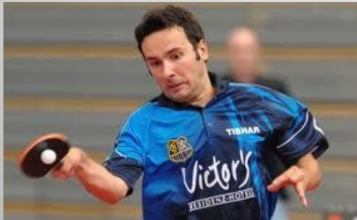
Table Tennis Camp from 01.04.2018– 04.04.2018 Tournament 05.-08.04.2018